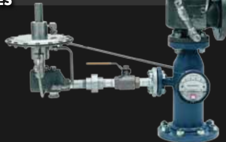
Tank Manifold facilitates a single nozzle for both Tank Blanketing and Venting