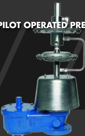
Pilot Operated Pressure/Vacuum Vents relieving to either atmosphere or header plus Tank Vacuum relief