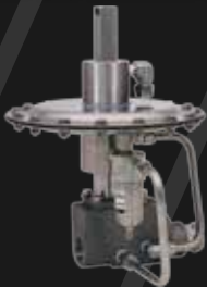
Pilot Operated Blanketing Valves