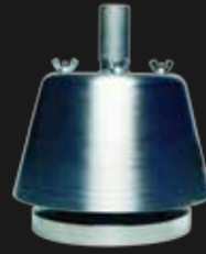
Pressure venting to atmosphere