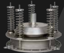
Emergency Relief Vents • Pressure • Pressure/Vacuum