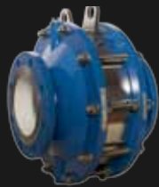
Inline Detonation Flame Arrestors