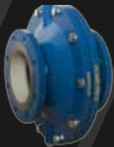
Inline Deflagration Flame Arrestors