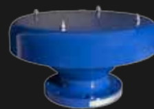
End of Line Flame Arrestors