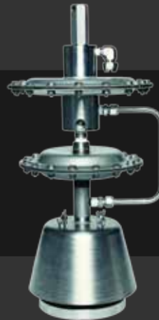
Pilot Operated Pressure Vents to relieve Tank Vapour to either atmosphere or header system