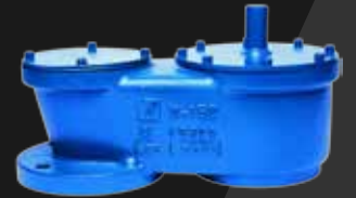
Vacuum venting into tank